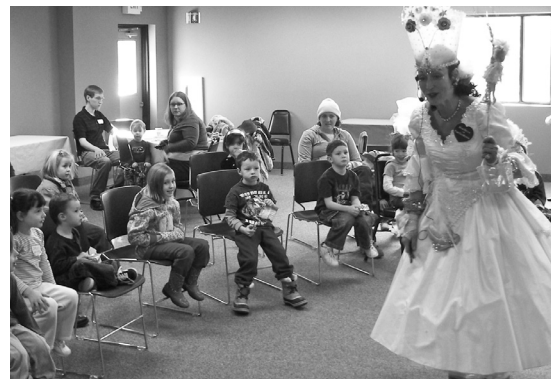
Maribella, the Fairy Godmother, entertained in the new Big Lake Public Library's programming room. In 2008, this library provided 125 programs for adults and children.

The theme of collaboration was repeated throughout the day. Big Lake Township paid one-third of the cost of renovating the building for library use, with the City of Big Lake paying the additional two-thirds. GRRL provides all the technology, staff, books, and other materials.